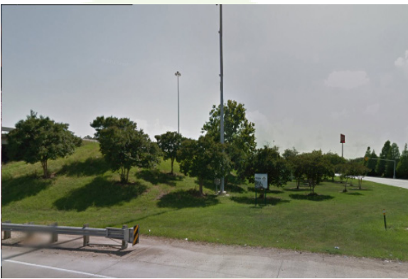
A - Sherwood entrance onto I-12W