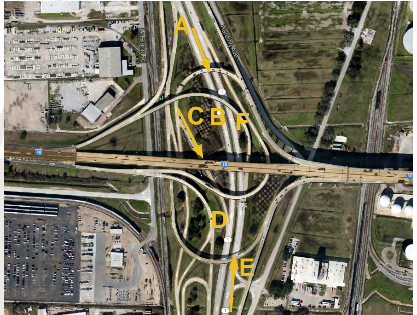
E - Hwy 1N-Exit to Port south of I-10